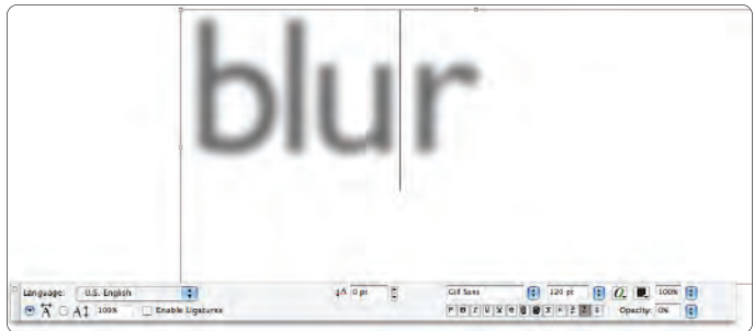
Editable blurred text

You can uncheck the Inherit Opacity button, allowing the Item and its shadow to have different transparencies. This allows any number of different creative effects, including turning the opacity of text to 0%, but keeping the drop shadow at 75%, and having editable blurred text.