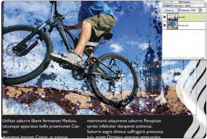
Using the PSD Import palette